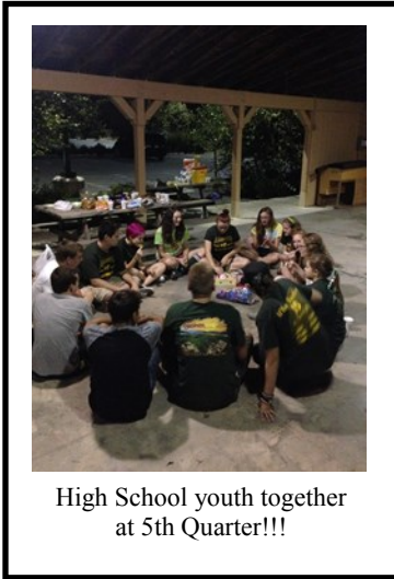
High School youth together at 5th Quarter!!!

September was soooooo fun and exciting with the Youth Praise Band and CW Singers re-suming rehearsals and all the great youth events. The 5 th Quarters have been a great Friday activity, and we had over 60 youth