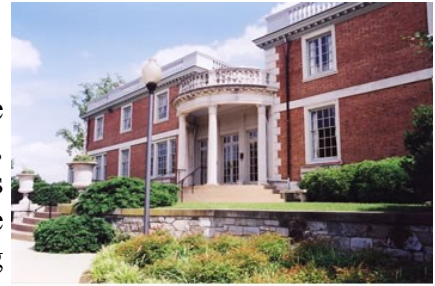
The Mansion at Strathmore