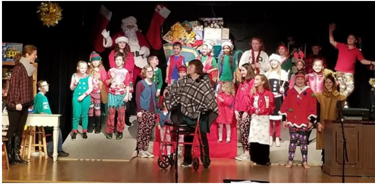
The Volunteer Reindeer Children's Musical