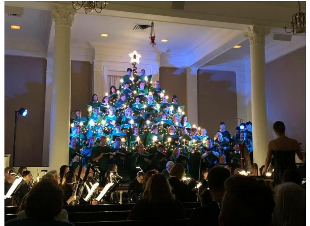
Living Christmas Tree