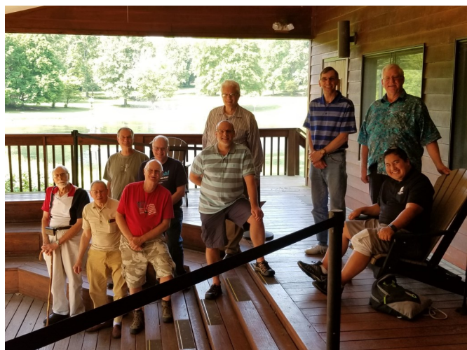
Men's Weekend Retreat - Hallowell Retreat Center June 8 & 9, 2018