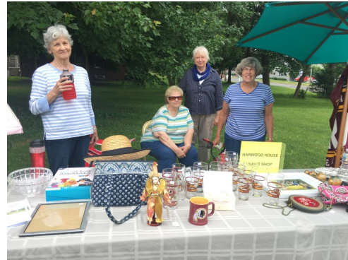
The Harwood House brings its sales skills!