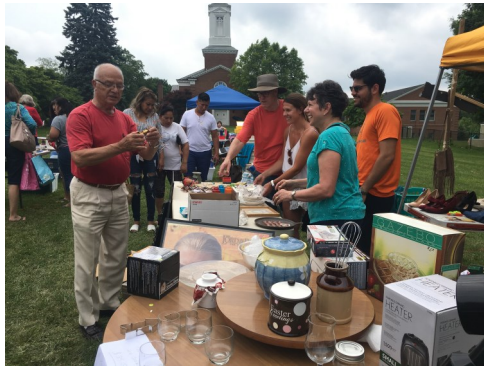
"Let's Make a Deal"

A big "Thank You" to all who made our DUMC Community Yard Sale a big success. Not only was it a productive fundraiser for the mission, it was a great opportunity to welcome our Damascus neighbors to our church. We hope to do this again, and to focus our efforts on introducing our Damascus Community to all the fabulous activities of our Church Community!